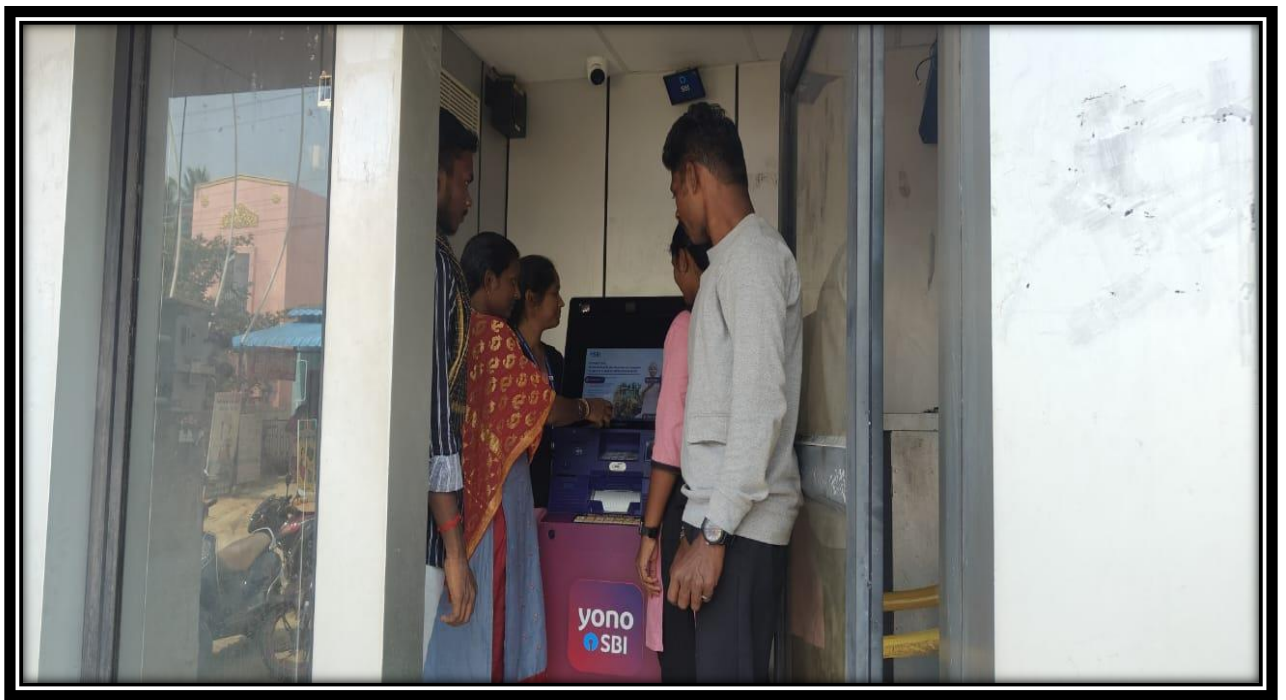
Students & Faculty members visited SBI ATM at State Bank of India, Karvetinagaram