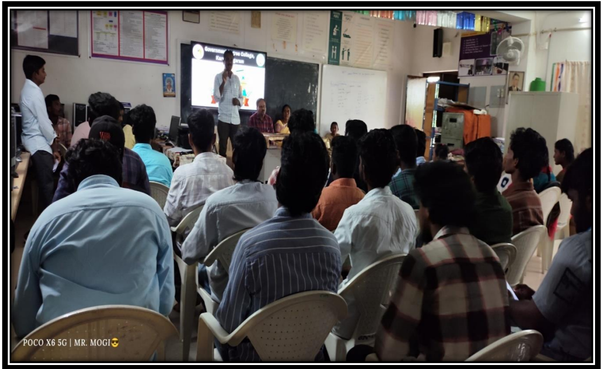
Inauguration of Certificate Course: GST Accounting in Tally Prime